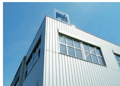
Headquarters in Altstätten