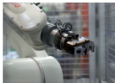
Shared production platform

PWB develops and produces customised drives, guide and locking units, turned and milled supply parts made of aluminium or stainless steel, and innovative components made of high-performance composites. Clever solutions. Made with precision.