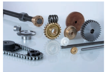
Portfolio of standard parts

Barzloostrasse 1, 8330 Pfäffikon (ZH) www.nozag.ch, info@nozag.ch