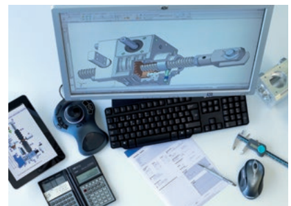
A well thought-out drive solution for every situation