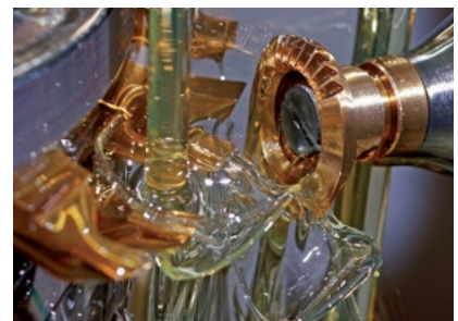
In-house production and assembly

Development, manufacture and sales of standard and custom designs for gear components, sprockets, worm and bevel gears, custom gears and other drive system components.