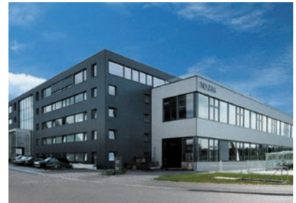
Head office in Pfäffikon (Canton of Zurich, Switzerland)