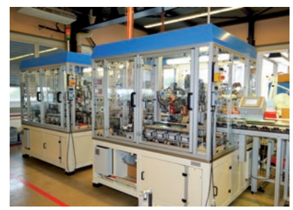
In-house production in Switzerland