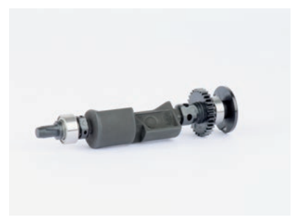
Customised ball bearing solutions in automotive industry